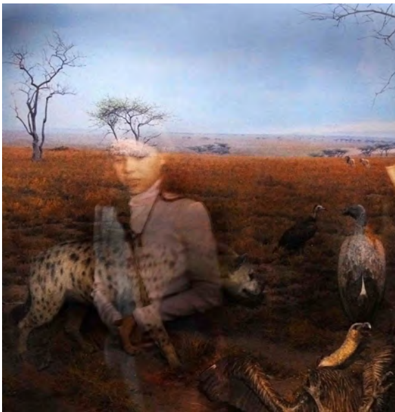
Hyenas , 2009, archival inkjet print, 20 x 20"