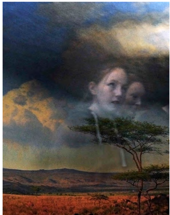
Savannah , 2009, archival inkjet print, 20 x 16"