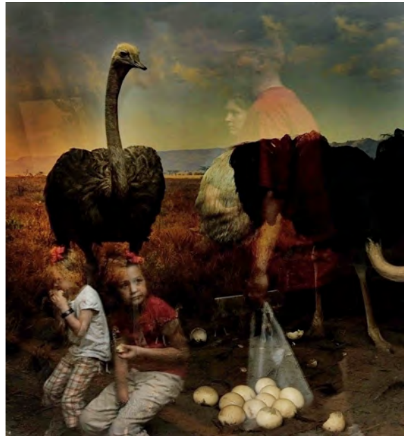
Ostrich , 2009, archival inkjet print, 20 x 20"