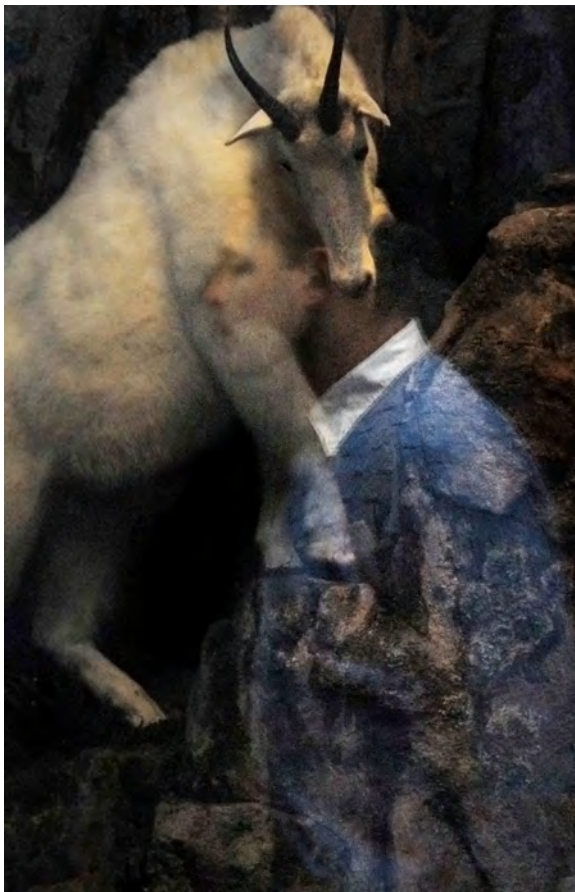
Mountain Goat , 2009, archival inkjet print, 20 x 16"