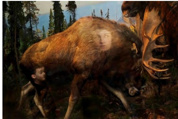
Moose , 2010, archival inkjet print, 16 x 20"