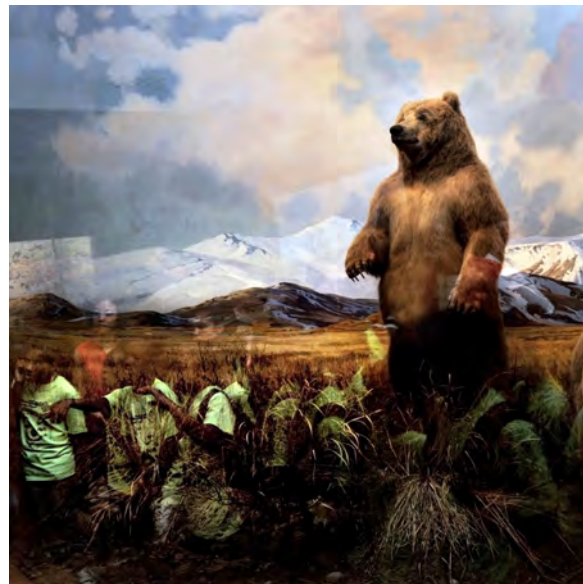
Bears , 2009, archival inkjet print, 20 x 20"