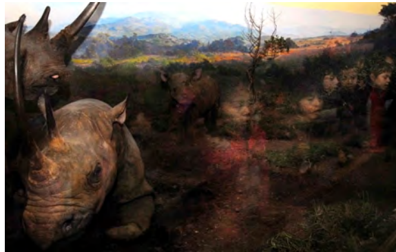
Rhino , 2009, archival inkjet print, 16 x 20"