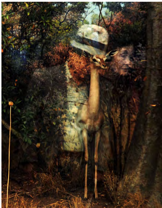
Doe , 2010, archival inkjet print, 20 x 16"