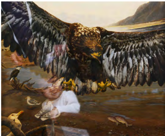
Bald Eagle , 2013, archival inkjet print, 20 x 20"