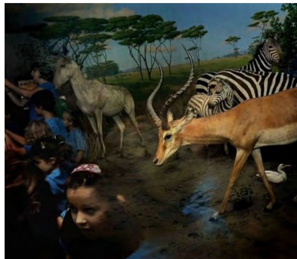
Safari , 2010, archival inkjet print, 20 x 20"