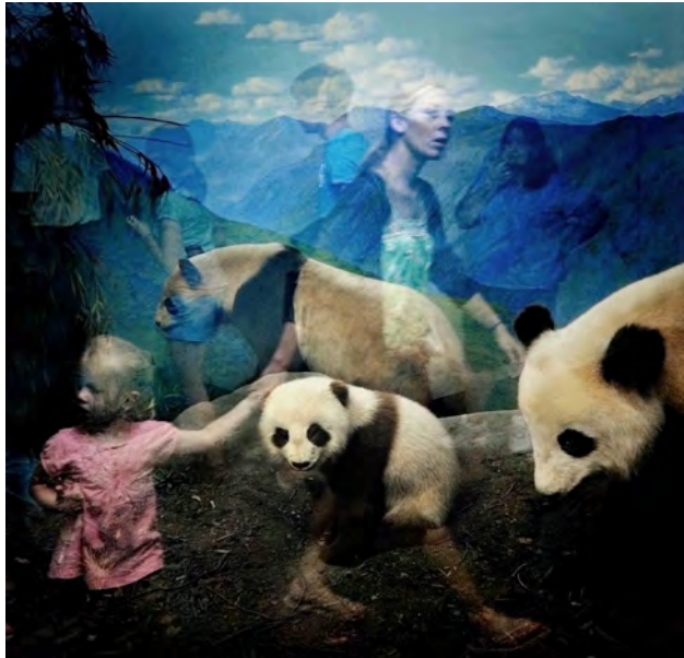
Pandas , 2010, archival inkjet print, 20 x 20"