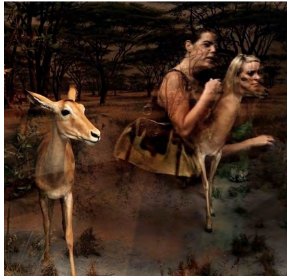
Gazelle , 2009, archival inkjet print, 20 x 20"