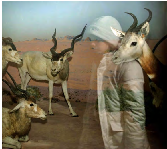
Horns , 2010, archival inkjet print, 20 x 20"