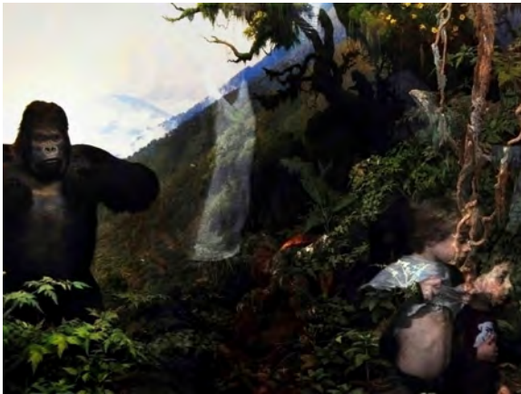
Gorilla , 2009, archival inkjet print, 16 x 20"