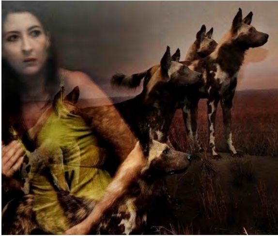
Hunting Dogs , 2009, archival inkjet print, 16 x 20"