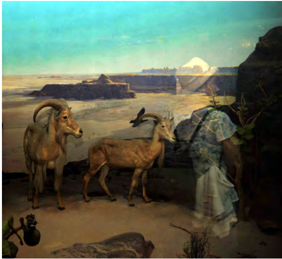
High Plains , 2010, archival inkjet print, 20 x 20"