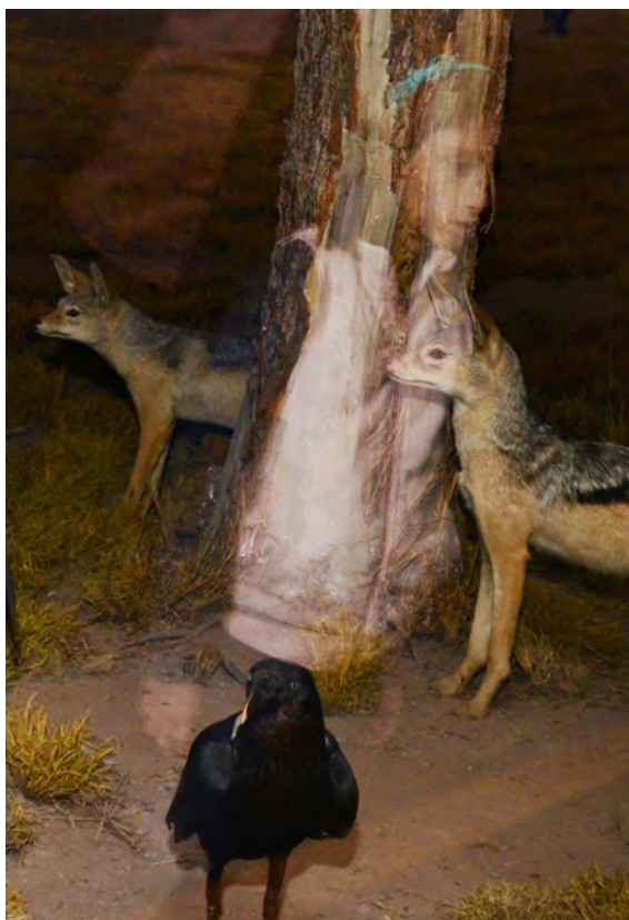
Coyotes , 2013, archival inkjet print, 20 x 16"