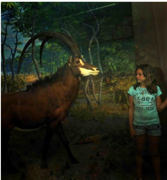
Sable Antelope , 2010, archival inkjet print, 20 x 20"