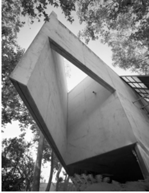
Schoenberg Hall, USC School of Music: HABS documentation, Los Angeles