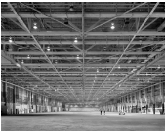
Boeing C-1 Aircraft production Facility: 2002 HABS documentation, Long Beach

The gymnasium celebration event was unlike anything I had seen. The outpouring of support confirmed the beloved structures place in the memory of the community.