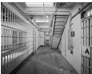
Santa Monica City Jail: 2010 HABS documentation, Santa Monica

Inspired by the legendary composer, this exceptional structure took the shape of a grand piano. It was lost to expansion of the adjacent film school building -- but not forgotten.