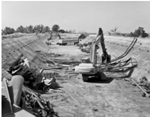
Highland Reservoir: 2009 HAER documentation, Yorba Linda

After serving the Southland for decades, the water shed was demolished to make way for a modern replacement.