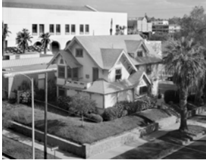
Rockhold House: 2004 HABS documentation, Riverside

Surrounded by development, commercial interests finally spelled the fate of this lone residential structure.