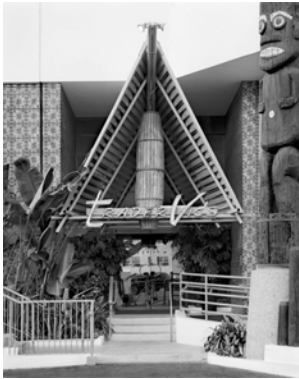
Trader Vic's: HABS documentation, Beverly Hills

Like its neighbor, Robinsons-May, Trader Vic's was one of the most recognizable landmarks in the City, located on one of the busiest intersections in the world.