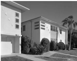
Lincoln Place Apartments: 2005 HABS documentation, Venice

Like its neighbor, Robinsons-May, Trader Vic's was one of the most recognizable landmarks in the City, located on one of the busiest intersections in the world.