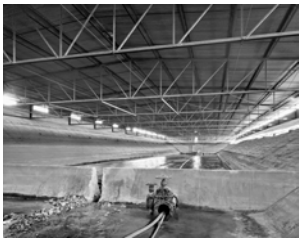
Highland Reservoir: 2009 HAER documentation, Yorba Linda

Surrounded by development, commercial interests finally spelled the fate of this lone residential structure.