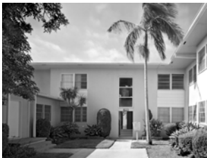
Lincoln Place Apartments: 2005 HABS documentation, Venice

When development threatened this unique apartment complex, preservationists fought a bold battle but still lost a quarter of the structures to demolition.