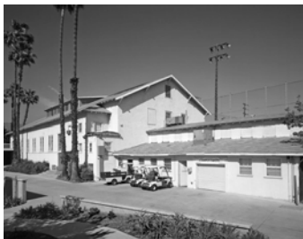
ULV Gymnasium: 2007 HABS documentation, La Verne

The gymnasium celebration event was unlike anything I had seen. The outpouring of support confirmed the beloved structures place in the memory of the community.