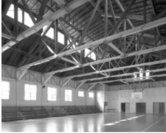
ULV Gymnasium: 2007 HABS documentation, La Verne