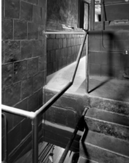
Beverly Hills Post Office: 2010 HABS documentation, Beverly Hills