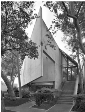
Schoenberg Hall, USC School of Music: HABS documentation, Los Angeles

Inspired by the legendary composer, this exceptional structure took the shape of a grand piano. It was lost to expansion of the adjacent film school building -- but not forgotten.