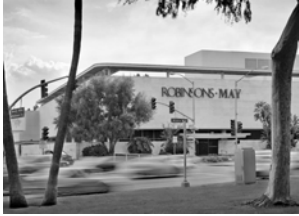
Robinsons-May Department Store: 2011 HABS documentation, Beverly Hills

Still standing, but not for long. Since 1952, the venerable landmark has occupied one of the busiest intersections on the planet, and was seared in the memories of millions of Southland commuters.