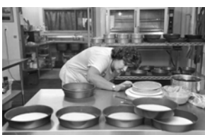
SMITH ISLAND, MD - NOVEMBER 10, 2009

Smith Island, once a home to watermen and crabbers, is looking to a new industry to help sustain itself: Baking Maryland's official state dessert, Smith Island Cake. The current residents hope the bakery will bring new life back to its economy and perhaps save some of the century old wooden homes that have been abandoned.