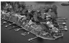
CHESAPEAKE BAY, MD - DECEMBER 3, 2008

The crew of the Thomas Clyde unloads the day's haul of oysters, 150 bushels, 16 hours after leaving port. A century ago, hundreds of skipjacks plied the Chesapeake Bay, sailing her waters and dragging dredges in search of oysters so lucrative they were called Chesapeake Gold. Now, the skipjacks are victims of the changing times as much as the dwindling oyster population. It just doesn't make much sense to sail big, wooden sailboats to catch fewer and fewer oysters.