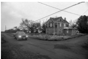
SMITH ISLAND, MD - NOVEMBER 10, 2009

Development along the edge of the bay near Annapolis has contributed to the bay's decline.